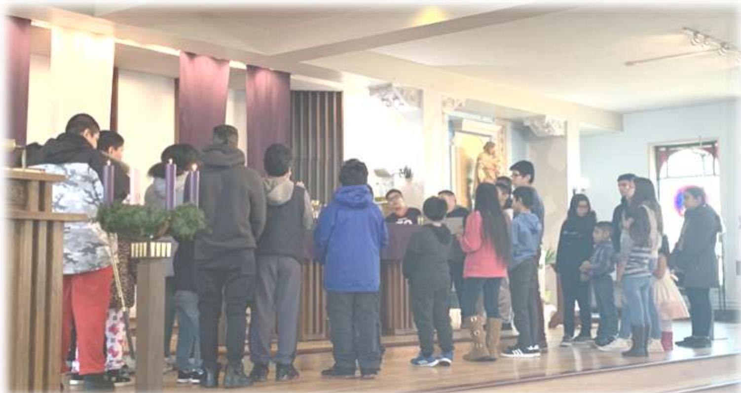
Assumption children at prayer around the Eucharistic table

At last week's 11am Mass / En la Misa de 11am la semana pasada . . .